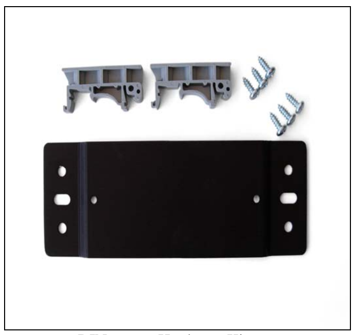
DIN-mount Hardware Kit