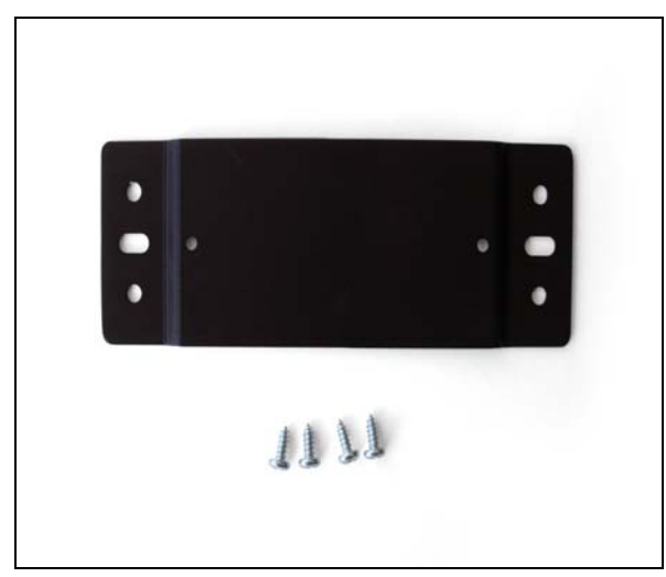
Wall-mount Hardware Kit