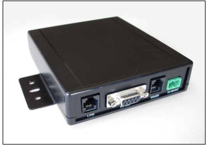
SM202T modem with Wall-mount bracket

The EN2KIT-WB is used to mount the SM202T/V.23 standalone modem onto a panel or the wall of an utility cabinet. The kit comes with a custom made bracket and four (4) #8 Philips screws.