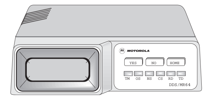
Figure 1-1 Front Panel